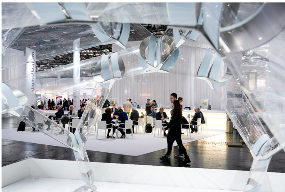
glass technology live (gtl)