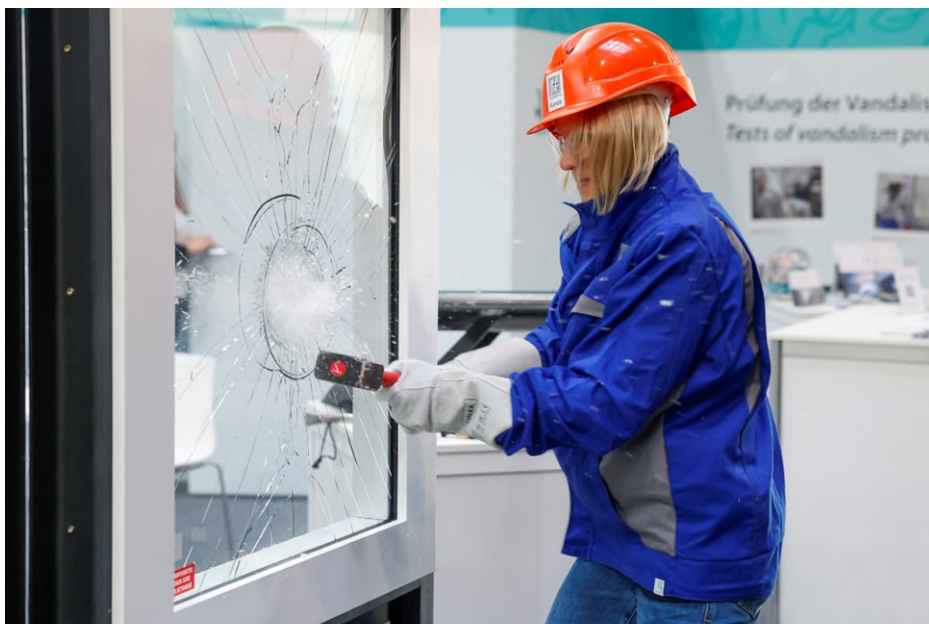
Handwerk LIVE, IFT Rosenheim, Vandalism Test