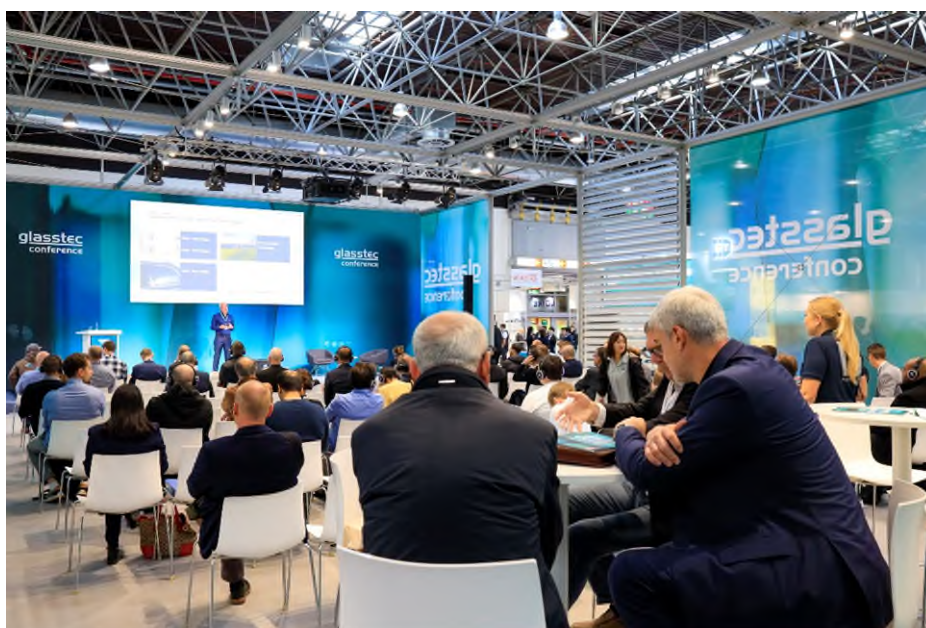
glasstec conference 2024