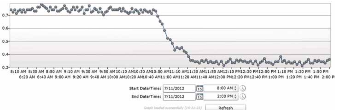
Figure 1: Ware spacing overview.

In this example, the bottles were positioned on the conveyor with a distance variation between the bottles of less than 0.3°! This distance variation is automatically kept low, because the automatic feedback corrects the ware spacing continuously and takes the correct corrective actions every minute against changes in temperature, speed fluctuations etc. >