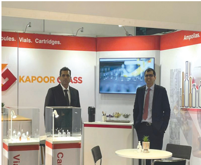
Kapoor Glass at CPHI & PMEC India

the 'Excellence in Export Promotion' category for COVID-19 pandemic vaccination drive during FY 2021-22.