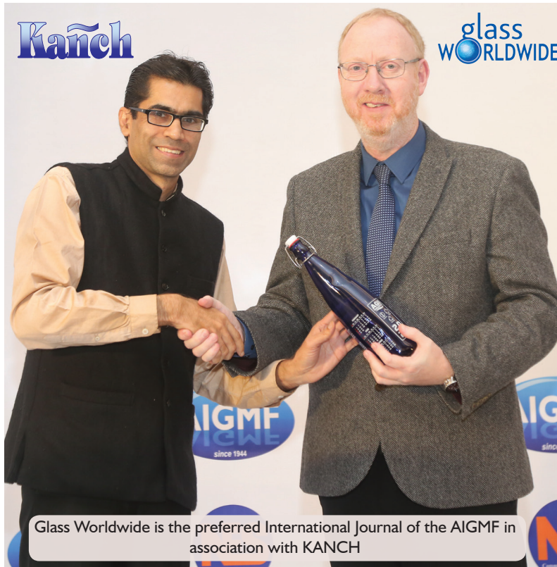
Glass Worldwide is the preferred International Journal of the AIGMF in association with KANCH

NES, located in Guwahati, is successfully utilising local resources and providing world class bonded refractories and monolithics to the container, float, solar, sheet, figured and opal glass sectors in India and abroad with products such as high alumina (42–99% AL 2 O 3 ) and basic refractories including 88–