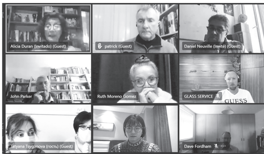
1 st IYOG2022 International Steering Committee Meeting underway

For planning the activities and to promote Glass, a Steering Committee under the banner of the International