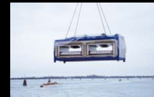
Murano, february 2010 Annealing Lehrs' Unloading for Ferro Murano company.