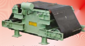
Over Band Magnetic Separator - (Operating Height from 50mm to 1000mm)