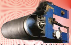
Magnetic Pulley - for Belt Width from (500mm to 2500mm)