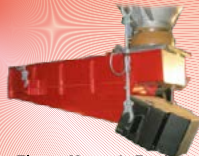
Electro Magnetic Feeder (Capacity 100Kg/Hr to 1000 TPH)