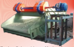
Exciter Driven Linear Motion Screen (Capacity 50TPH to 1500TPH)