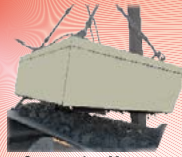
Suspension Magnet - Operating Height from (50mm to 1000mm)