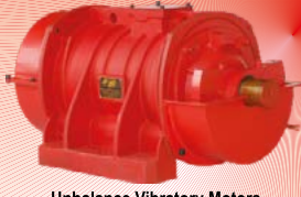
Unbalance Vibratory Motors