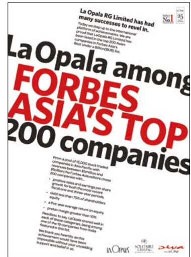
La Opala features in the Forbes list of Asia's 200 best companies with sales under $1 billion.

The impact of a multi-brand marketing strategy is said to have placed La Opala at the forefront of Indian glassmakers in terms of turnover according to latest industry statistics. With customers throughout the world,