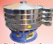
Circular Vibratory Screen (24 Inch Dia to 100 Inch Dia)