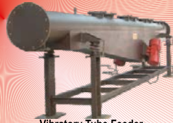
Vibratory Tube Feeder