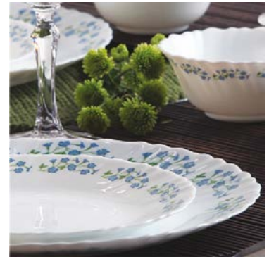
A diverse range of opal and lead crystal tableware is produced by La Opala.

His daughter-in-law also works for the company, co-ordinating La Opala's important product design and advertising initiatives. The glassmaker introduces 20-30 new products every year. This high turnover is considered necessary because consumers are constantly looking for something different. The company's distinctive brands are La Opala opalware, Solitaire