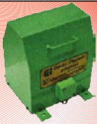
Bin-Vibrators for Hoppers / Silo / Chute