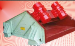
Unbalance Motorised Vibratory Feeder (Capacity 100Kg/Hr to 2000 TPH)