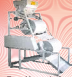
Drum Type Magnetic Separator (Single / Double / Triple Drum)