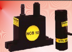
Pneumatic Ball / Roller / Linear Vibrator