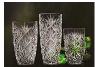
Hand-crafted 24% lead crystal items are manufactured.