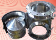
Super Intensity Rare Earth Tube Magnet - for Pipe Line