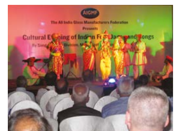
The AIGMF cultural evening was attended by conference delegates, exhibition visitors and exhibitors.