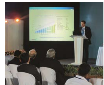
'Hot batch: The future of batch preparation' was the title of a conference presentation delivered by Zippe.