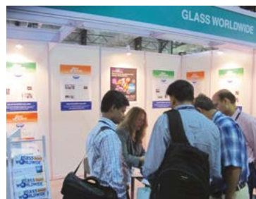
Glass Worldwide supported the event.