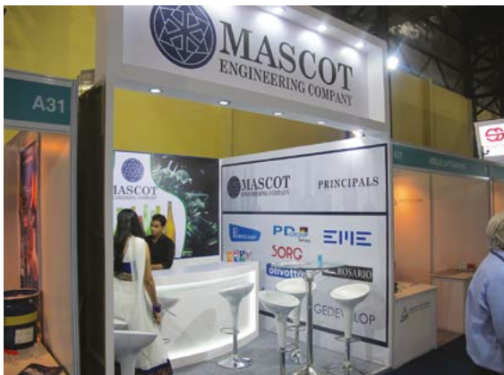
Many leading international principals were present on the Mascot exhibits.