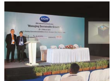
'Optimisation by automation' was the theme of a joint XPAR Vision/Bottero conference paper.