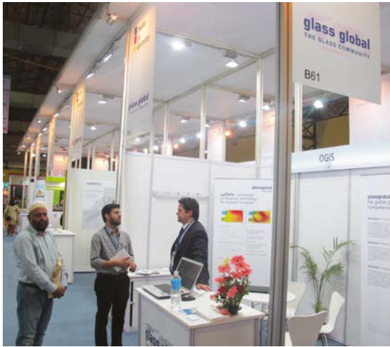
The VDMA's German pavilion.