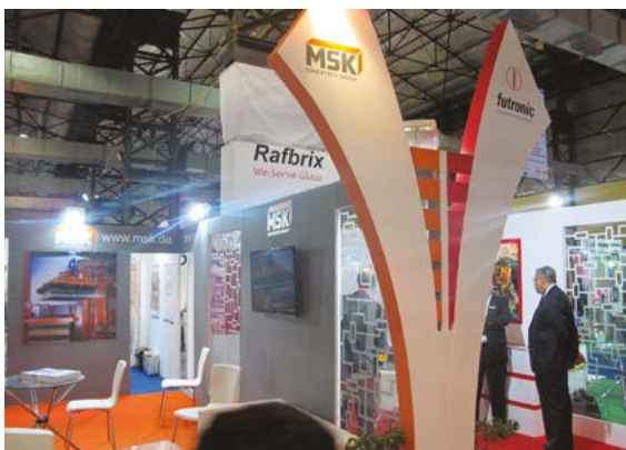
Representatives of Rafbrix were present, together with many of the company's international principals.

in the areas of glass production, processing and applications to 3347 trade visitors. Exhibitors included many of the industry's most established names, including the following cross-section: Adelio Lattuada, AGR, AIGMF, Arkema, BDF, Bottero, Bystronic glass, Car-Met, Ceracon, CGE Continental Glass Engineering, CNUD-EFCO, DSF Refractories, Dukhiram Maurya, Eirich, Electroglass, EME, Emhart Glass, Emmeti, Invensys Eurotherm, Ferlam, FIC, Fickert+Winterling, Fives Stein, Flammatec, Fond Metall, Forehearh Services, Forma Glas, Forza G Italia, Fosbel, futronic, Gedevelop, GIMAV, Glamaco, Glass Service (Czech Republic), Glass Service (Italy), Glass Worldwide , Graphoidal, Grenzebach, Heat Applications, Hegla, Heye International, Hindusthan National Glass & Industries, Horn, Indotherm, IRIS Inspection Machines, Italcarrelli, JSJ, KRS, Lahti, Lattimer, Lizomontagens, Lubitech, Mappi International, Mascot, MSC & SGCC (Tiana), MSK, NARCO, OCMI, OGIS, Olivotto, OMSO, Optima, Parkinson-Spencer Refractories, P-D Refractories, Pennekamp, Pennine, Pneumofore, PPG, Putsch, Quantum, Rafbrix, Ramsey, RHI, Rondot, Rosario C2C, Saint-Gobain SEFPRO, Schiatti Angelo, SGS, Shamvik, Sheppee International, Siemens, Sorg, Strutz, SVA, SynergX, Tecno5, Tecoglas, Henry F Teichmann, Total Lubricants, Triulzi Cesare, Vetriglass, VDMA, VMA, Waltec, Z&J, Zecchetti and Zippe.