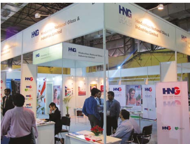
HNG maintained a strong presence.

The next GLASSPEX India will be held from 13 to 15 March 2015, again in Mumbai. ■