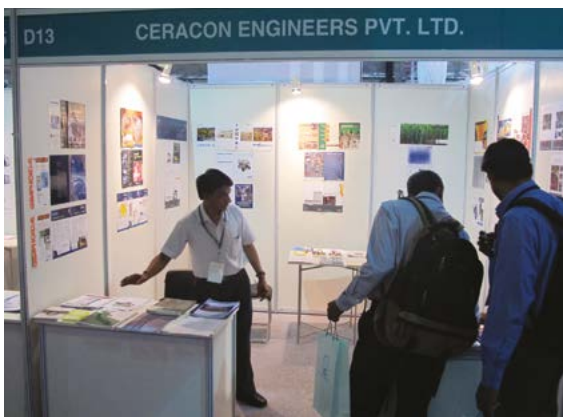
Ceracon represented a diversity of leading international suppliers.

G LASSPEX India 2013 - International Exhibition for Glass - Production, Processing, Products – took place at the Bombay Convention & Exhibition Centre for the third time from 20 to 22 March 2013. Despite a difficult market environment, more than 180 exhibitors from 22 countries presented the latest products and innovations