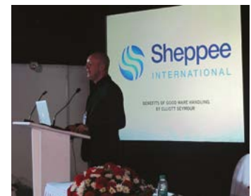
'Tangible and intangible benefits of good ware handling' was the theme of a Sheppee International conference presentation.